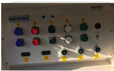
CONNECTION CAM-LOK STANDARD