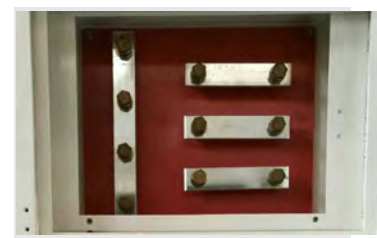
Voltage change link board