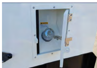
LOCKABLE EXTERNAL FUEL FILL