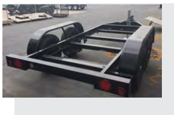
HEAVY DUTY TRAILER