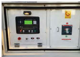
REAR CONTROL PANEL WITH MLCB