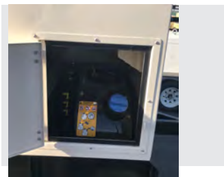
DEF Tank Location