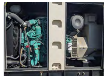
EASY ACCESS FOR MAINTENANCE